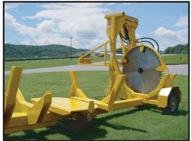
Pendulum Swing Design