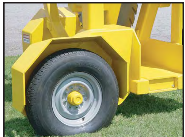
Heavy-duty Wheels & Hub Assembly