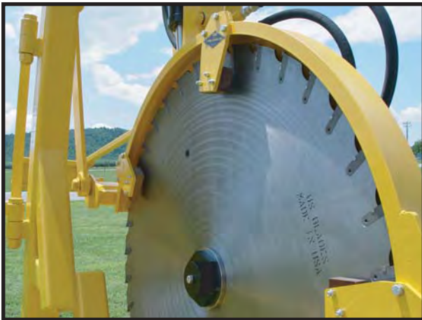
Hollow Ground Carbide Tipped Inserted Teeth